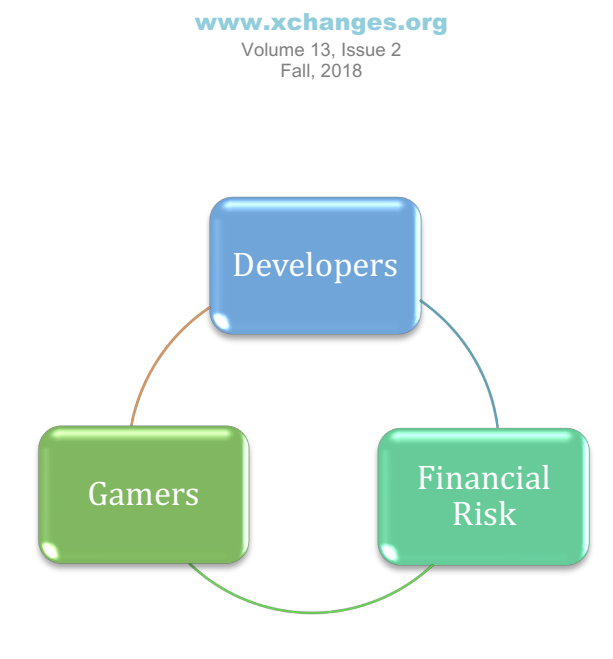
Figure 3: The Gaming Trifecta

In the spin-off Assassin's Creed games in which there were female protagonists, like in Liberation or Assassin's Creed Chronicles: China , players found that the games were too short (only lasting about 6–10 hours) for the amount of money they were being asked to spend on it. Furthermore, the games were often riddled with glitches and bugs, had uninteresting or incredibly predictable plots, and unpopular side missions and/or main quest objectives. Gamers simply aren't interested in a game that isn't fun, engaging, and well-constructed. Thus, the endless cycle of the gaming trifecta.