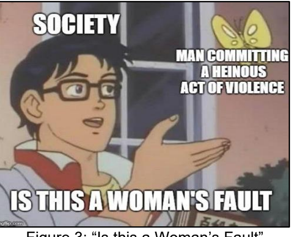
Figure 3: "Is this a Woman's Fault"

Milner may not reference particular or universal audience, but he recognizes two types of connection: studium , "connection with an image on a cultural level," and punctum , "connection with an image at the personal level" (30). Memes can be interpreted through these connections; for example, the image in Figure 3 is commentary on a cultural issue.<sup>3</sup>