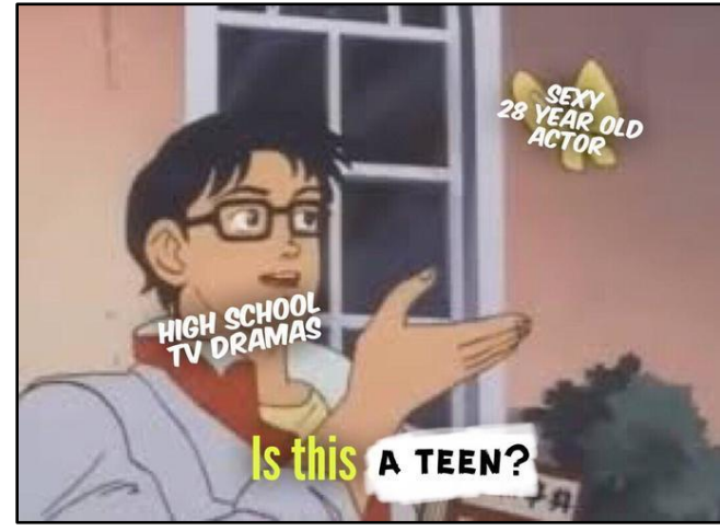
Figure 2: "Is this a Teen?"

www.xchanges.org Volume 15, Issue 1 Spring, 2020