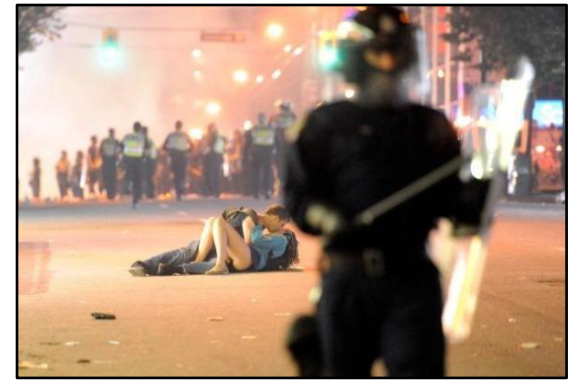
Figure 6: "Vancouver Riot Kiss"

www.xchanges.org Volume 15, Issue 1 Spring, 2020