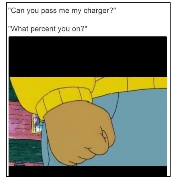
Figure 5: "Can You Pass me my Charger?"

Images, Smith recognizes, allow the viewer to infer meaning from what is familiar (120). Smith explains, "Within our cultural frameworks, we understand visual aspects of nonverbal communication to carry a limited and likely range of meanings"; for example, when a person is standing with his fist clenched and face red, onlookers would assume this person is angry (120). The enthymeme, as Aristotle proposes, allows the audience to complete the argument for themselves, which means the speaker must construct an argument that builds within it a system where the audience infers what is the "probable" conclusion given all the other information. The meme functions in the same manner. The community pulls an image and creates a probable interpretation, which is then used within each iteration to create the interpretive framework. Memetic internet media can create new codes for its culture, but often it digitizes communication that has already been established. For example, Smith exemplifies the clenched fist as a visual indication of anger, which is a universal symbol for feelings of rage. The "Arthur's Fist" meme follows the same logic but uses a children's cartoon from the 1990s to replicate this visual code to indicate frustration with trivial matters (knowyourmeme). Figure 5 reads as one speaker being frustrated because they cannot get back their property, the phone charger, because the borrower feels they need it more.<sup>5</sup>