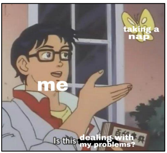
Figure 4: "Is This Dealing with my Problems?"

Next, punctum is a personal connection with the meme's message. Figure 4 is meant to resonate with the individual.<sup>4</sup>